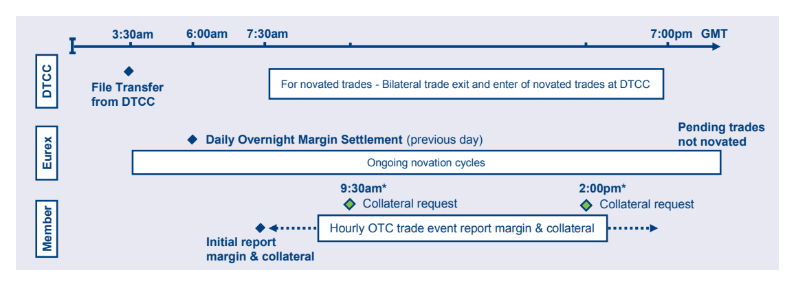
Illustration of the daily clearing and novation timeline

The following principles are applied to clearing and novation: