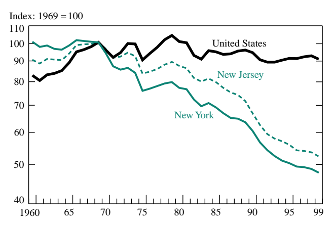
Chart 1 Trends in Manufacturing Employment: New York, New Jersey, and the Nation