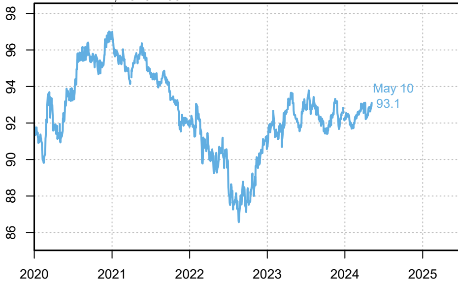
Nominal Effective Exchange Rate Narrow Index, 2010=100