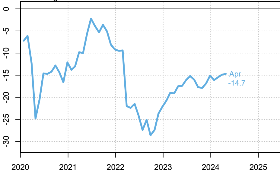
Consumer Confidence Percentage Balance