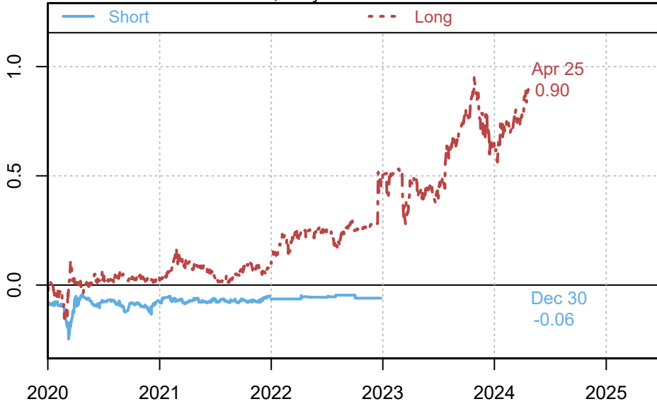
Short-Term and Long-Term Interest Rates 1-month LIBOR Rate Rate, 10-year Government Bond Rate