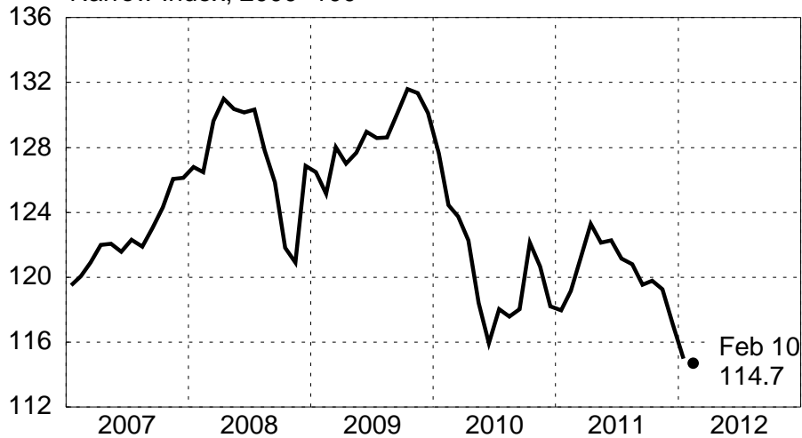
Nominal Effective Exchange Rate Narrow Index, 2000=100