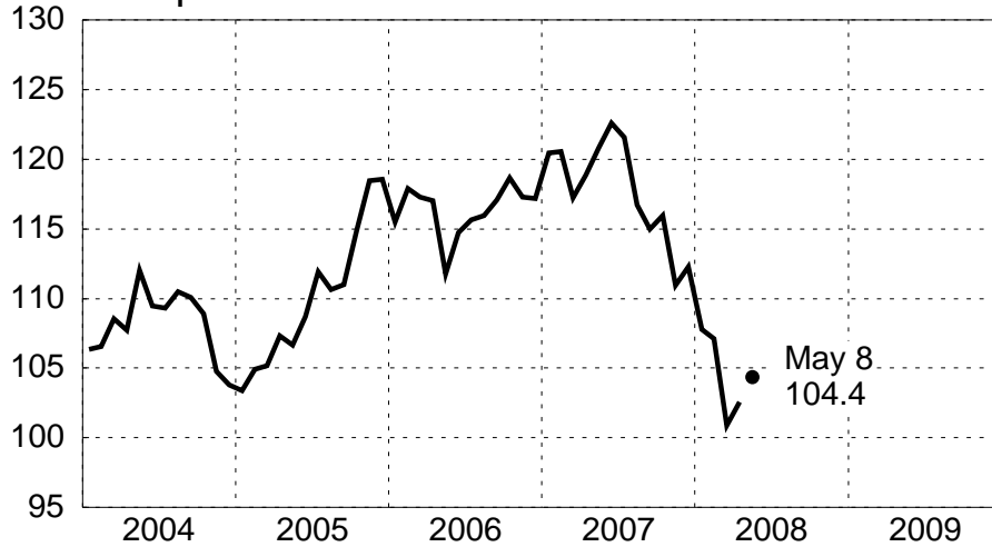
Yen per Dollar