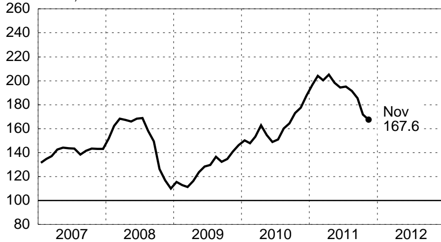
IMF Commodity Price Index (Excluding Fuels) Index, 2000=100