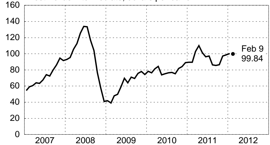
U.S. Spot Crude Petroleum Price West Texas Intermediate, dollars per barrel